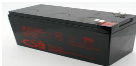
Fig:2 Lead-acid battery

It demands for a battery with longer running hours, lighter weight with respect to its high output voltage and higher energy density. Among all the existing rechargeable battery systems, the lead acid cell technology is the most efficient and practical choice for the desired application. The battery chosen for this project was a high capacity lead acid battery pack designed specifically for vehicles. Plastic casing is provided to house the internal components of the battery.