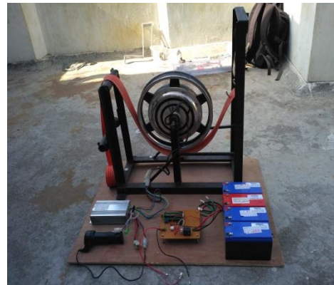
Fig:4. Experiment setup